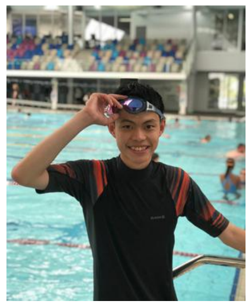
TERM 1 2023